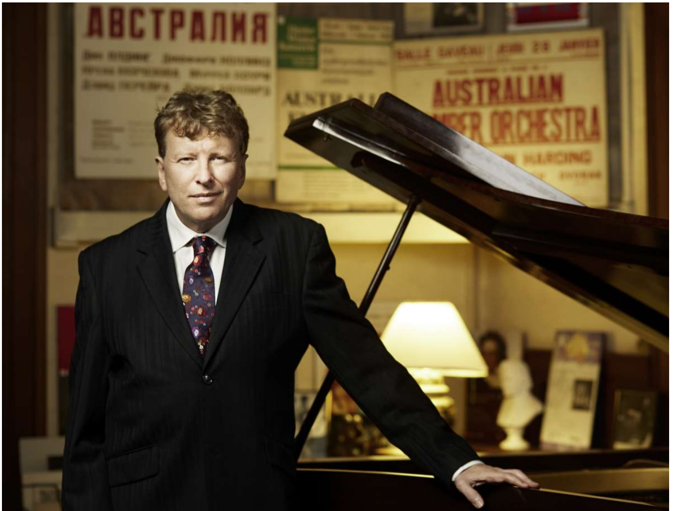
Piers Lane.