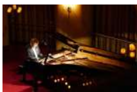
Piers Lane playing Chopin by candlelight at Government House, Western Australia.

✉ Subscribe Add Disqus to your siteAdd DisqusAdd Privacy